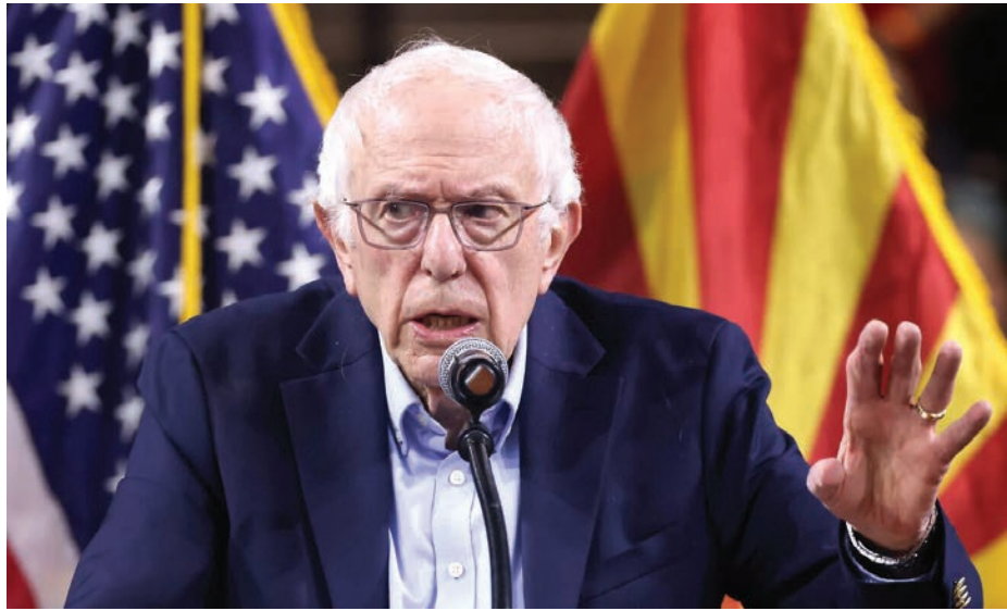
Sen. Bernie Sanders (I-Vt.) speaks at a “fight oligarchy” rally at Mullett Arena in Tempe, Ariz., March 20, 2025.

(JNS) – Members of the governing board of the U.S. Holocaust Memorial Museum have asked Senate Minority Leader Chuck Schumer (D-N.Y.) to remove Sen. Bernie Sanders (I-Vt.) from the United States Holocaust Memorial Council amid reports that the senator has not attended a single meeting in 18 years. Sanders was appointed to the council in 2007. The board, which meets twice a year to oversee the D.C. museum’s mission, programming and educational