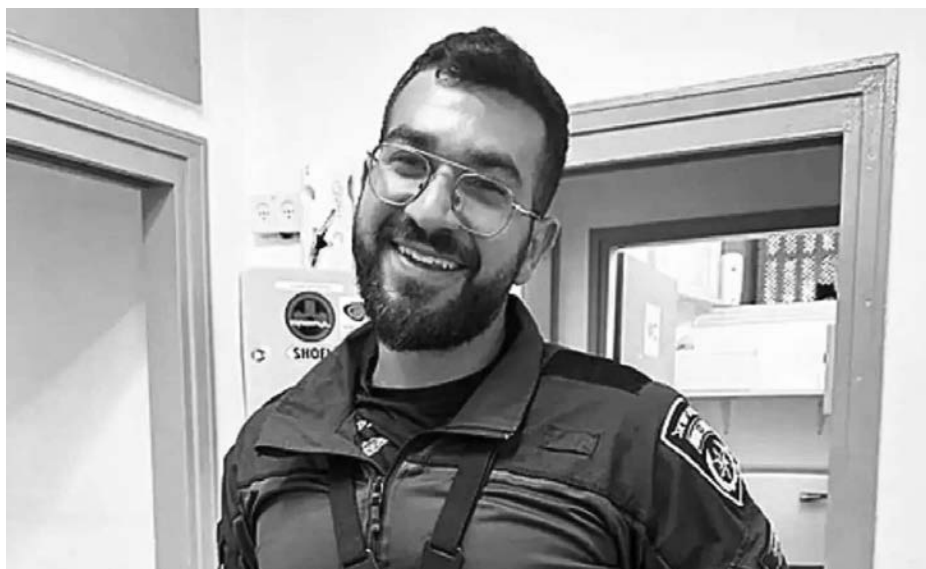
Israel Border Police Master Sgt. Ran Gvili.