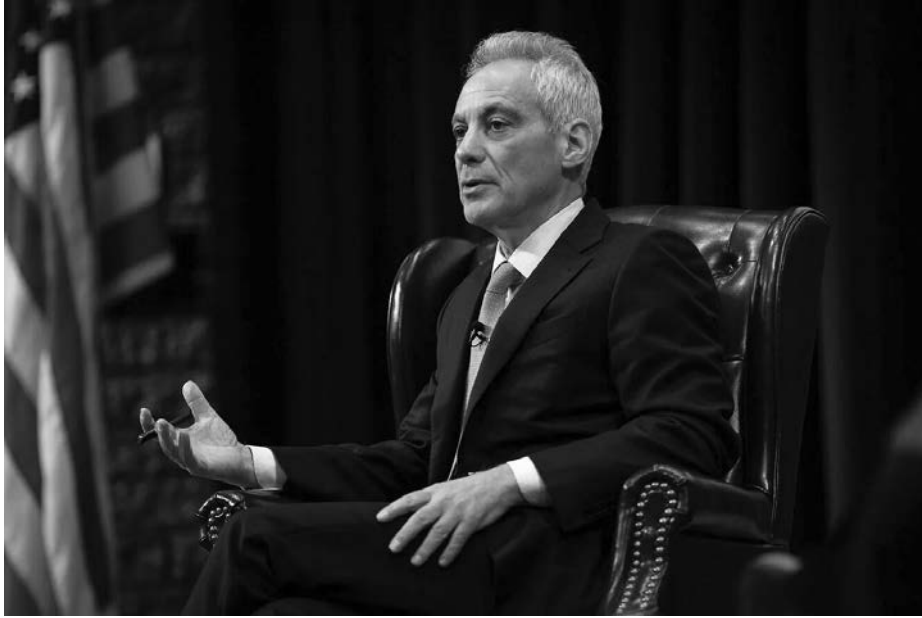
Rahm Emanuel, then-U.S. Ambassador to Japan, visits the U.S. Naval War College at Naval Station Newport in Rhode Island, Feb. 22, 2024.

(JNS) – The questions that Kamala Harris’s campaign asked Pennsylvania Gov. Josh Shapiro about the Jewish governor’s possible ties to Israel to vet him as a potential vice presidential can-