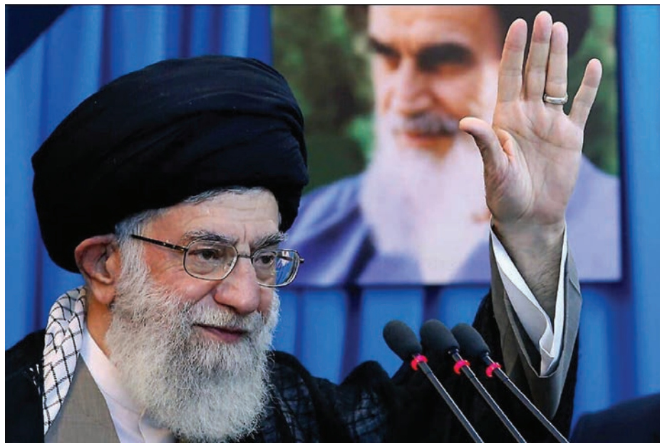
Ayatollah Ali Khamenei, Iran's supreme leader, speaks at the Imam Khomeini Hussainia conference hall in Tehran on July 24, 2015.