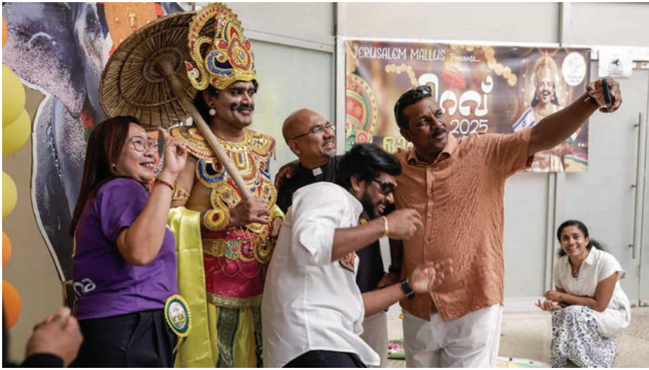
Foreign workers from India enjoy traditional holiday celebrations in Jerusalem, Sept. 8, 2025.