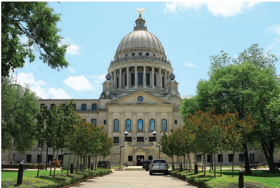
The Mississippi State Capitol building in Jackson, Miss.