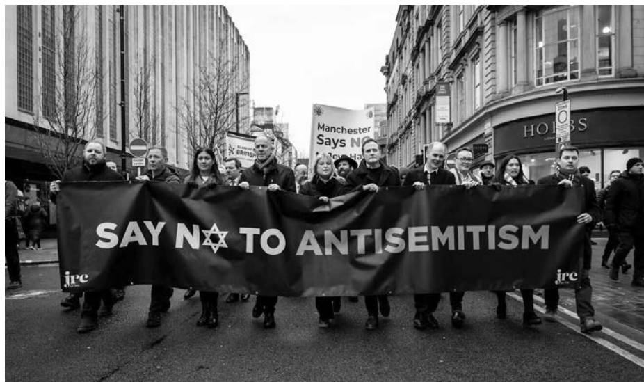
A protest against antisemitism held in Manchester, England; among those in attendance is the then-U.K. Security Minister Tom Tugendhat, Jan. 21, 2024.