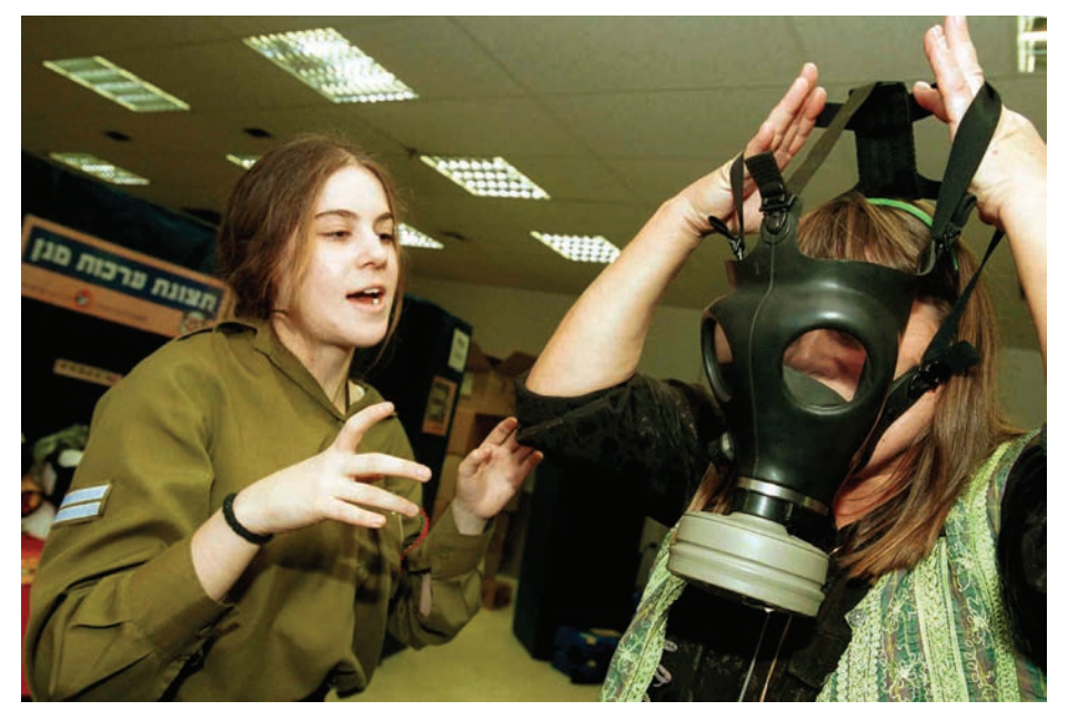
A soldier teaches a woman how to wear and use a gasmask during the Second Intifada, Oct. 30, 2001.

(JNS) – Over the [last weekend in November], more than 120 Orthodox women aged 26-50 enlisted in the Israel Defense Forces as part of the Shlav Bet ("Phase 2") program track for religious women over the usual recruitment age.