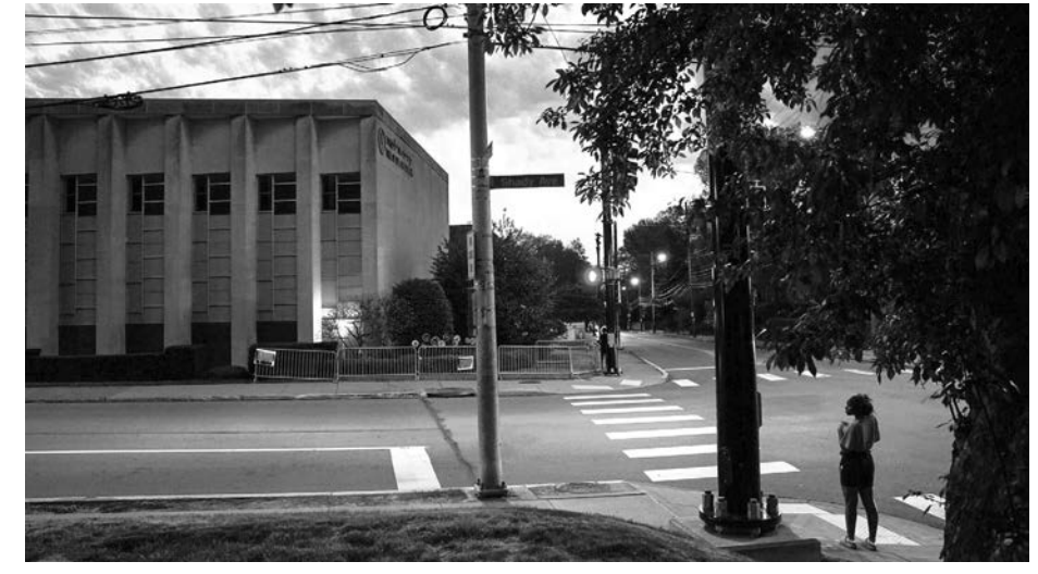
The Tree of Life Synagogue seen in Pittsburgh, April 21, 2023.