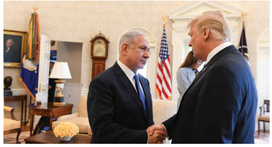
Israeli Prime Minister Benjamin Netanyahu meets with U.S. President Donald Trump at the White House, March 5, 2018.