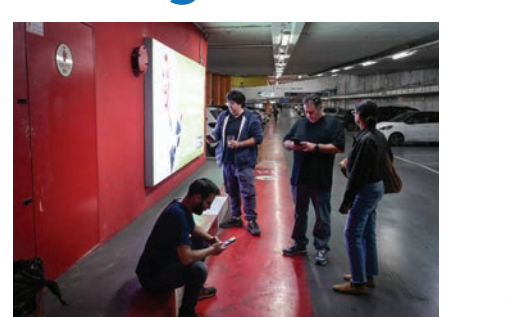
Israelis take cover inside a bomb shelter as siren alerts are sounded in Tel Aviv, Dec. 16, 2024.

Don't leave your 401(k) or 403(b) unattended