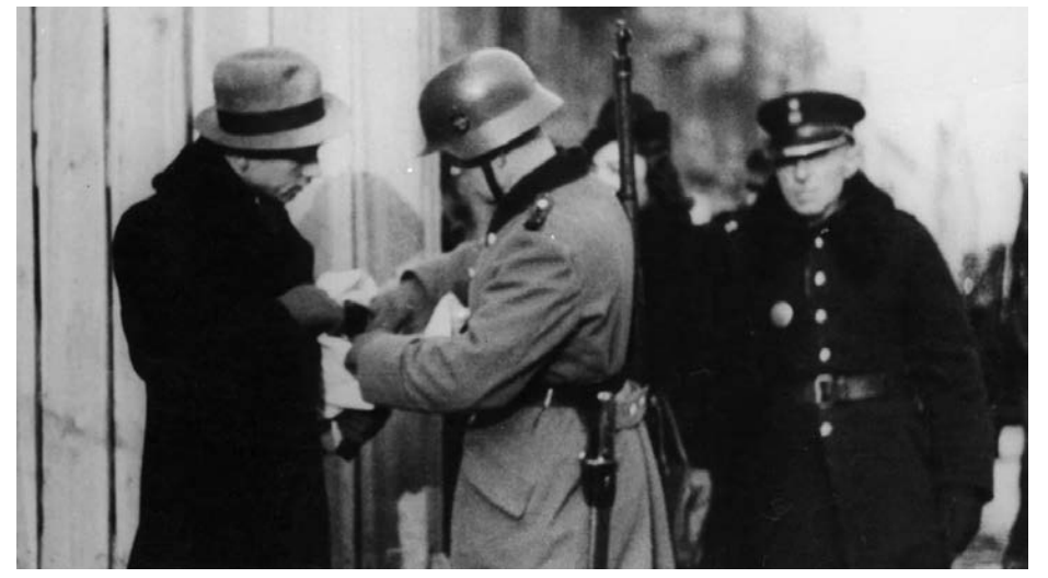
Polish and German police officers inspect the papers of a Jewish pedestrian, Warsaw, 1941.