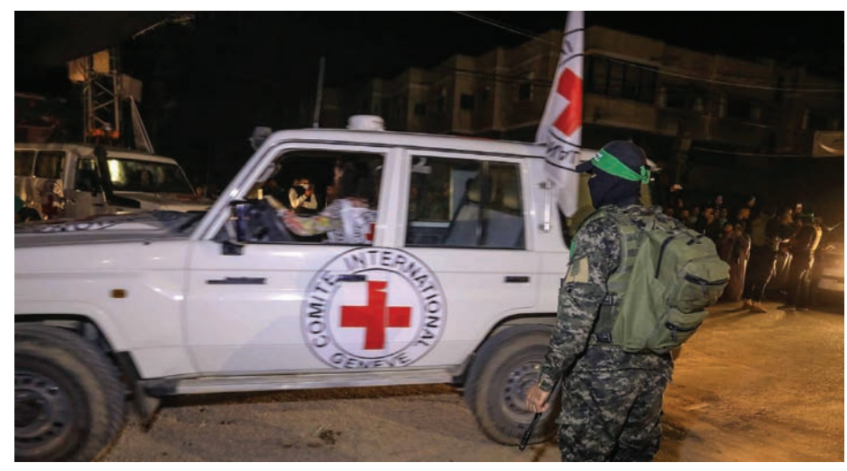
A Hamas terrorist releases Israeli hostages to the Red Cross in Rafah, in the southern Gaza Strip, Nov. 28, 2023.

(JNS) - A senior Hamas official has denied reports that the Gaza-based terrorist group is refusing to provide a full list of the living hostages, according to Qatar's "Al-Araby Al-Jadeed" news outlet.