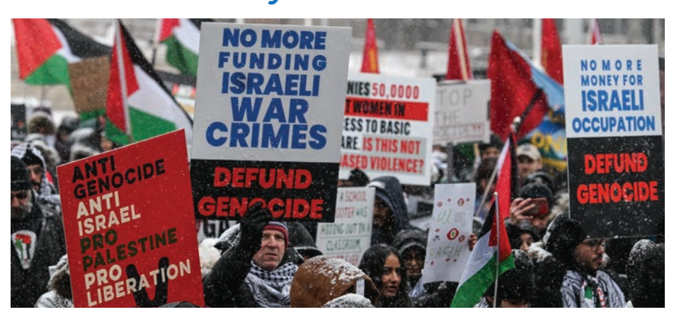
Pro-Palestinian protestors rally in Edmonton, Canada, Feb. 25, 2024.