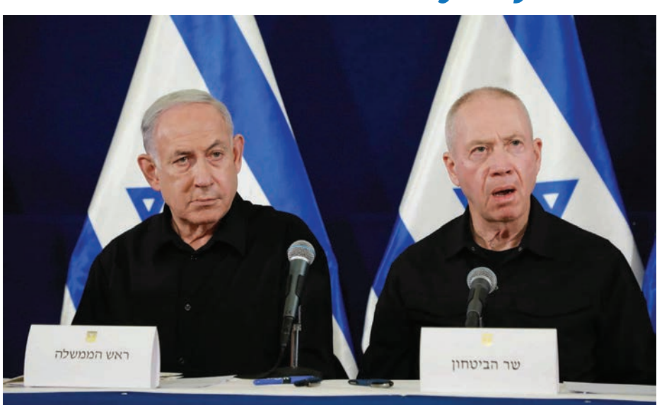
Prime Minister Benjamin Netanyahu and Defense Minister Yoav Gallant hold a press conference at the Ministry of Defense in Tel Aviv, Oct. 28, 2023.