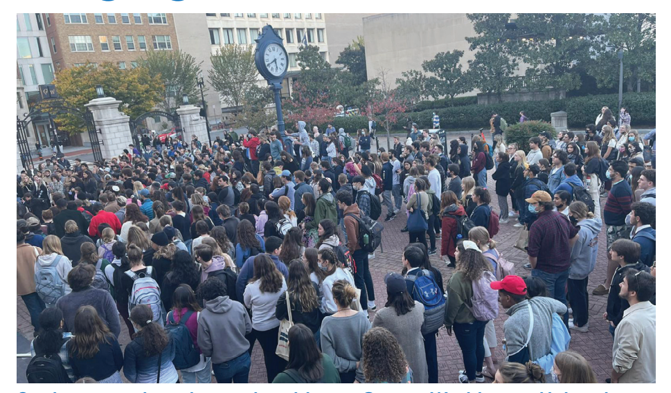
Students march against antisemitism at George Washington University, Nov. 2, 2021.

(JNS) – The Israel education organization StandWithUs (SWU) has filed a complaint against George Washington University with the U.S. Department of Education's Office for Civil Rights, alleging a violation of Title VI of the Civil Rights Act of 1964.