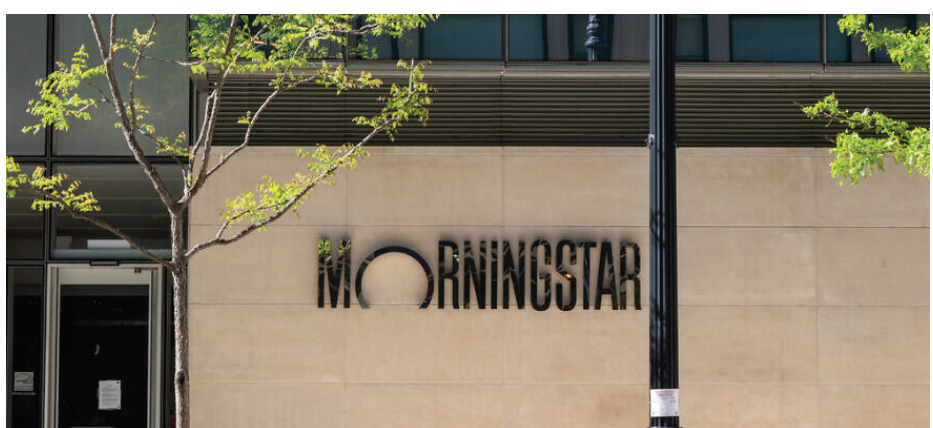
Morningstar financial-services building in downtown Chicago.