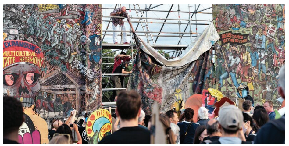
Artwork by Taring Padi at the Documenta 15 festival in Kassel, Germany, was covered up after a backlash against its anti-Semitic images, June 22, 2022.

the Spanish city of Guernica during World War II. The anti-Jewish bias has been attributed to the anti-Israel sympathies of the Indonesian curators.