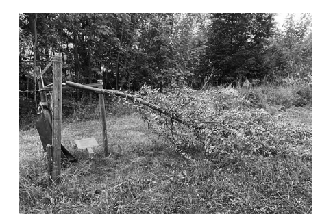
Vandals cut down memorial trees at the former Nazi camp of Buchenwald in Germany, July 19, 2022.