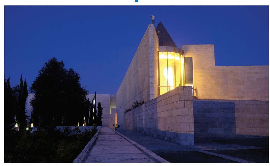
A view of the Israeli Supreme Court in Jerusalem.