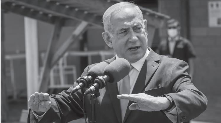
Benjamin Netanyahu, on trial for corruption, pleads not guilty and walks out of courtroom.