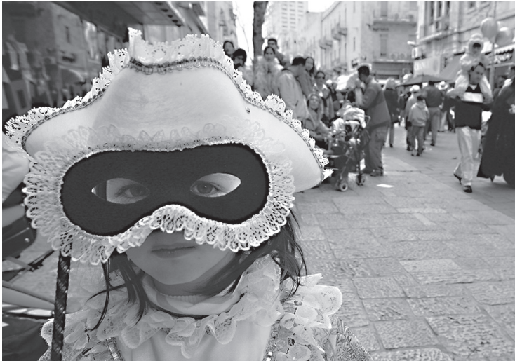
A girl in Jerusalem wearing a mask for Purim, which starts this year on Thursday, February 25.