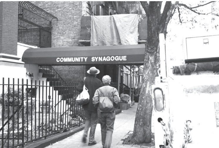
People walk by a synagogue on November 27, 2020, in New York City.

an earlier ruling that allowed the restrictions and in December, a federal appeals court followed the Supreme Court’s lead, ruling that the capacity limits on houses of worship in areas with rising COVID-19 cases constituted a violation of religious liberty. The appeals court then sent the case back to the district court to decide if the percentage capacity limits — which limited attendance to 25% of the building’s capacity in “red zones,” where COVID positivity rates were especially high, and 33% in “orange zones,” where positivity rates were somewhat lower — were needed to accomplish the government’s aim of slowing the spread of COVID-19. The district court blocked those percentage capacity limits Tuesday, February 9, leaving houses of worship subject to the 50% capacity limit that was in place before the cluster zones plan.