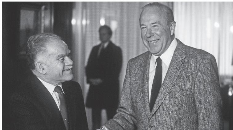
Israeli Prime Minister Yitzhak Shamir, left, shakes hands with Secretary of State George Shultz in Washington, Nov. 27, 1983.

Shultz was a moderate Republican who in a number of economic Cabinet positions during the Nixon presidency advanced affirmative action as redress for discrimination. He was the rare instance of a Nixon Cabinet secretary who emerged (See Freedom Page 2)