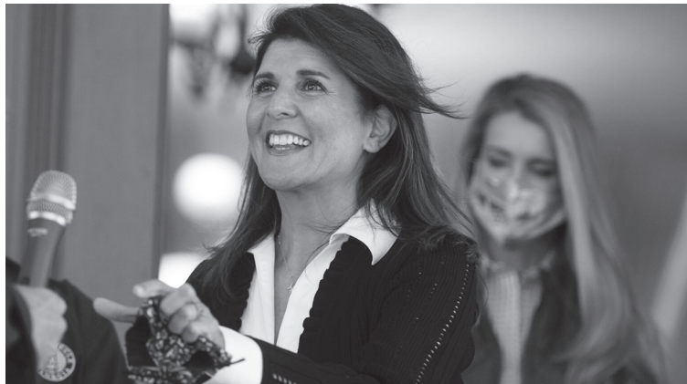
Nikki Haley at a campaign rally for Kelly Loeffler in Monroe, Ga., Oct. 30, 2020.

Her frontline pro-Israel advocacy has made her extremely popular at the annual American