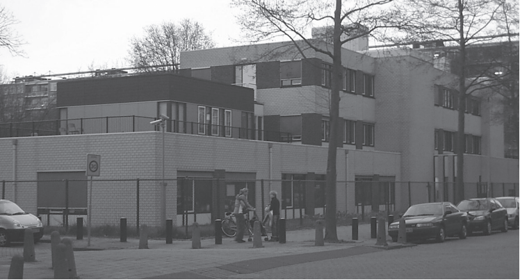
The Orthodox Cheider school in Amsterdam referred cases of alleged sexual abuse to Dutch police.