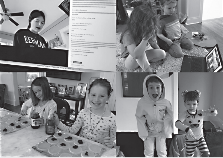
Students at the Leffell School in Westchester County celebrated Purim from home in 2020. Westchester County emerged as an early epicenter of the coronavirus outbreak last spring in New York State.