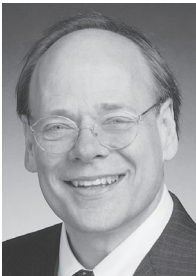
Cong. Steve Cohen

Congressman Steve Cohen (D-TN), chairman of the House Judiciary Subcommittee on the Constitution, Civil Rights, and Civil Liberties, presided recently over a hearing on “The Constitutional Means to Prevent Abuse of the Clemency Power.” As a senior member of the Judiciary Committee, Congressman Cohen has introduced joint resolutions in the current and previous Congresses to limit the pardon power outlined in Article 2 of the Constitution. In his opening remarks, Congressman Cohen said, “There are few things more fiercely urgent than the need to grant clemency to